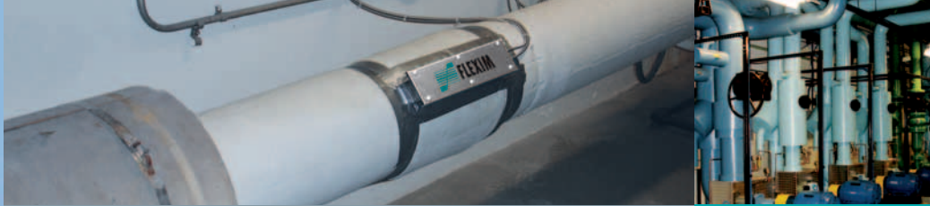
Measuring principle of FLUXUS BTU (here in a chiller plant)