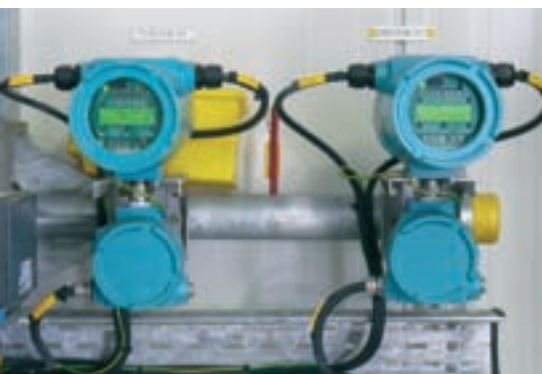
Secure measurement in hazardous areas: FLUXUS® G800 ensures a reliable measurement of the gas volume flow

Natural gas reservoirs serve as a buffer between supply and demand. The extraction as well as the transport rates of this energy carrier are variable only to a certain degree. The demand however fluctuates depending on the time of day as well as, above all, on the season. Natural gas consumption can be 15 times larger during the winter than it is in the summer. It is therefore necessary to follow the example set by the squirrel: When extraction and acquisition from foreign sources exceeds the demand, the excessive natural gas is stored so that it is available at short notice if needed.