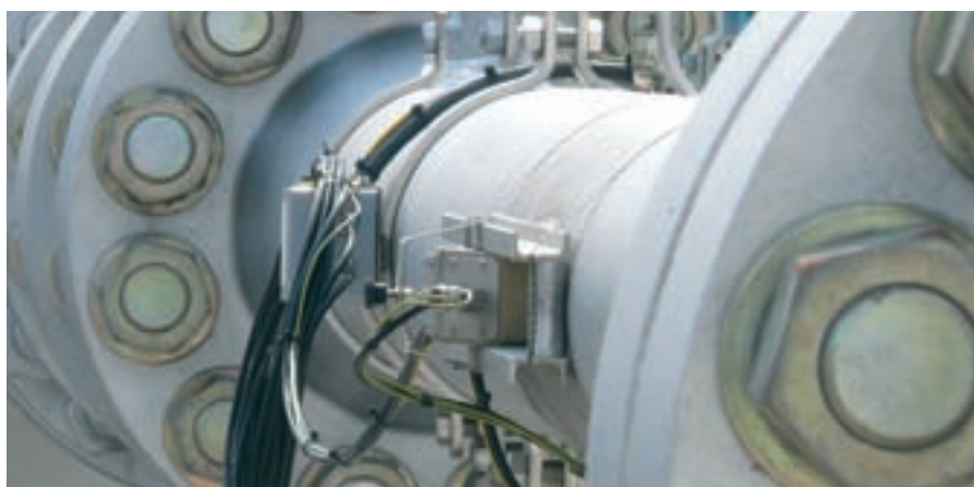
Not impressed at all by high pressures! The clamp-on transducers are on the safe side of the pipe.

Innovations at all levels of signal emission, reception and processing brought the breakthrough. A unique emission and signal treatment process was developed. In order to maximize the signal-to-noise-ratio, the intelligent measurement algorithm adapts to the varying application conditions and automatically optimizes the measurement. An integral transducer system rounds off the concept. The universally applicable shear wave trans-