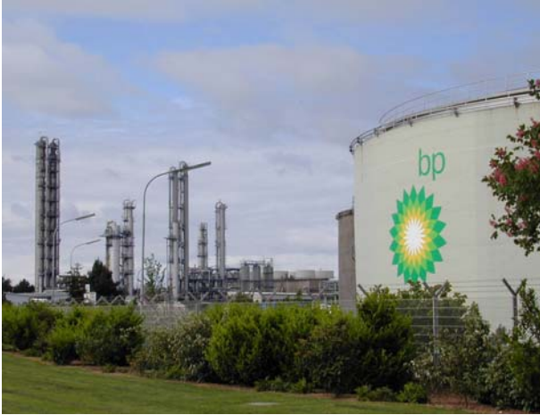
The BP Plant in Cologne

Translation of an article in the FLEXIM Newsletter UPDATE 6 (2005)