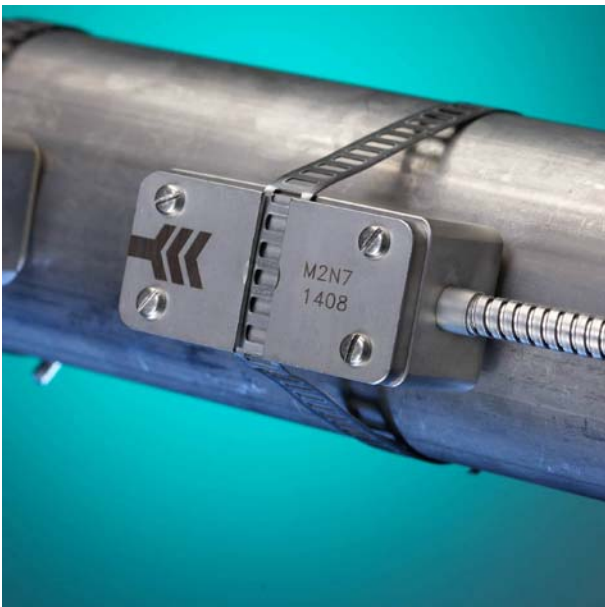
Standard clamp-on ultrasonic flow transducer

The applications for portable on-site flow measurement are numerous and very diversified. In every production facility, with its many boilers, reactors, tanks, fractionating columns, and cooling towers, there are scores of sites which only allow for mobile on-site flow measuring. The latter might be necessary in order to control the function or accuracy of permanently installed flow measuring units. Even a simple flow control can be very important in order to draw conclusions about a running production process. This is especially important when dealing with media that tend to leave deposits or abrade, for example tar. Such media can rapidly lead to problems or inaccuracies. In such cases, the company is quite glad that a simple and fast control can be done under normal operating conditions, without the need to remove a permanently installed measuring instrument or cutting into a pipe.