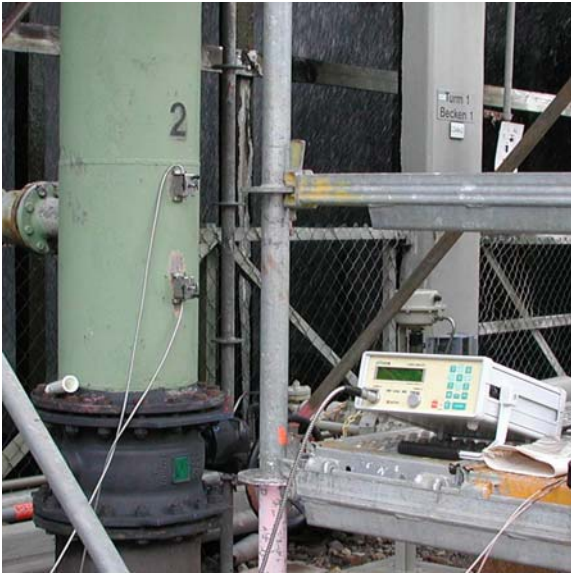
The FLUXUS ADM 6725 measuring on-site

The applications for portable on-site flow measurement are numerous and very diversified. In every production facility, with its many boilers, reactors, tanks, fractionating columns, and cooling towers, there are scores of sites which only allow for mobile on-site flow measuring. The latter might be necessary in order to control the function or accuracy of permanently installed flow measuring units. Even a simple flow control can be very important in order to draw conclusions about a running production process. This is especially important when dealing with media that tend to leave deposits or abrade, for example tar. Such media can rapidly lead to problems or inaccuracies. In such cases, the company is quite glad that a simple and fast control can be done under normal operating conditions, without the need to remove a permanently installed measuring instrument or cutting into a pipe.