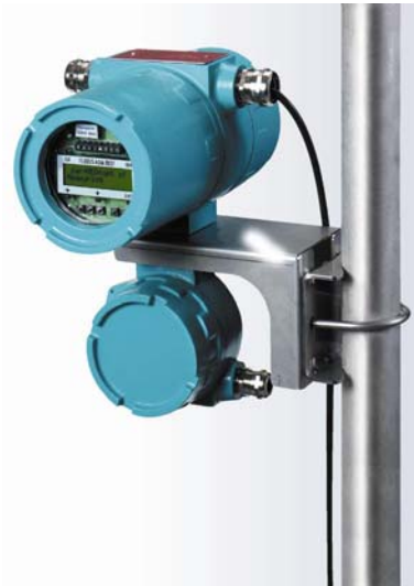
Explosion protected flow meter FLUXUS ADM 8027

In chemical plants, measuring in explosion hazard areas is all in a day's work. This poses no problem at all for FLEXIM'S flowmeters. They can safely be used in zone 2. By special permit and with an external detector, the BP department for special measurements even uses the FLUXUS® ADM 6725 for quick measuring in zone 1 hazardous areas. In addition, FLEXIM offers special transmitters and transducers for use in zone 1 ATEX.